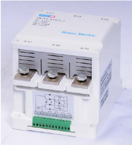
CKJ11-250/1.5 AC vacuum contactor