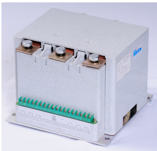
CKJ11-500/3.6 AC Vacuum Contactor