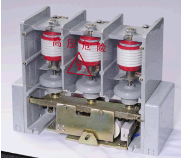
JCZ5-250A/7.2kV AC Vacuum Contactor