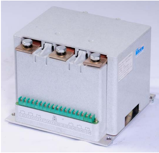
CKJ11-630/3.6 AC Vacuum Contactor