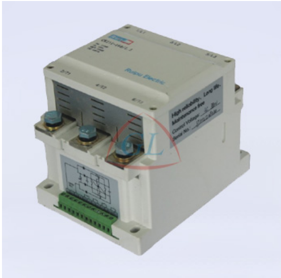
Product outline drawing